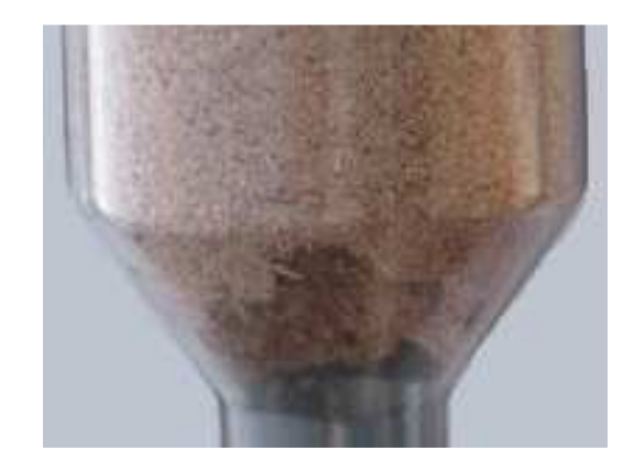
Figure 2. Material hang-up (rathole and arching) of material in a system causes process down-time