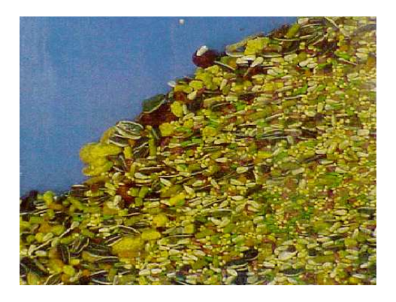
Figure 3. Segregation patterns formed during pile formation in a process